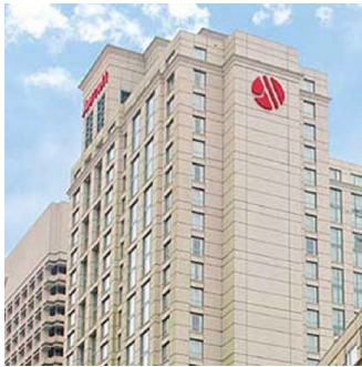
Norfolk Waterside Marriott 235 E Main St, Norfolk, VA 23510 (757) 627-4200